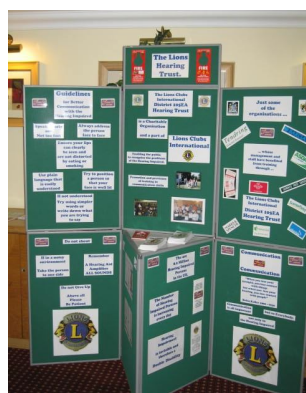
Lions Hearing Trust display at Autumn Forum