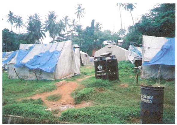
The Damage – December 2004