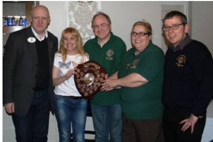
The Errant Gnomes, from Marston Green & District Lions, again